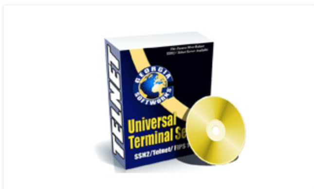
GSW Telnet Server for Windows

“Advanced Solutions has a strong reputation and vast market experience. They are a great asset to our reseller network”